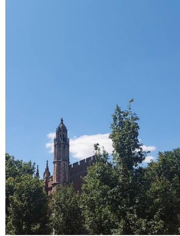
Beautiful campus scenery

This summer, I had the incredible opportunity to participate in the McKelvey International Student Research Internship Program at Washington University in St. Louis. It was an amazing 10-week program! During the internship, each student worked with a professor in a lab, gaining invaluable insights into the academic culture and research practices. On top of that, the university arranged so many fantastic activities for us to experience American culture. These experiences enriched my time in St. Louis, making the program not only an academic journey but also an unforgettable cultural exchange.