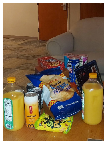
Party Food and Drinks

In addition to university-sponsored activities, we visited the St. Louis Zoo, the Missouri Botanical Garden, and Armory STL on the weekends. On the Fourth of July, we took a trip downtown to watch an air show and fireworks. We also had a simple party in our dorm, where we ate, drank, and played games like charades, telephone, and the English version of the game Werewolf . During the Olympics, we made plans to wake up early, have breakfast together, and watch live broadcasts to support Taiwan. We also went to Six Flags St. Louis, where we screamed our hearts out on thrilling roller coasters. We also organized a road trip to Nashville, where we experienced a completely different lifestyle. It was a lively and relaxed city, with a vibrant atmosphere day and night.