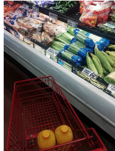
Grocery Shopping Every Week