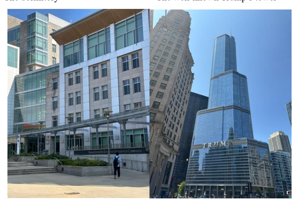
The well-known Trump's tower