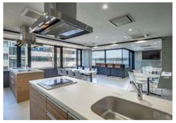
Shared Living / 共有リビング