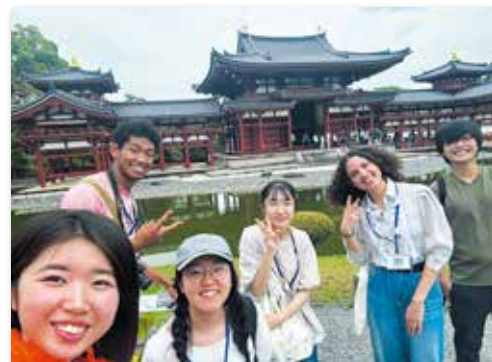
Uji-city Walking 宇治散策