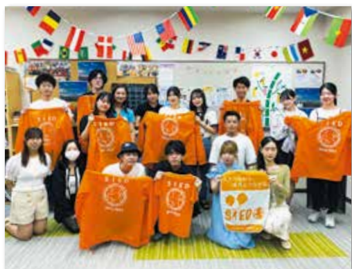
SIED Imadegawa Campus / 今出川キャンパス