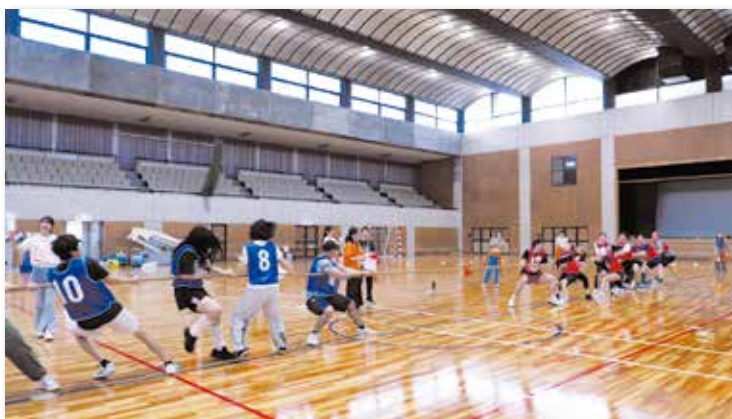
Sports Event -Tug of War 大運動会 -綱引き