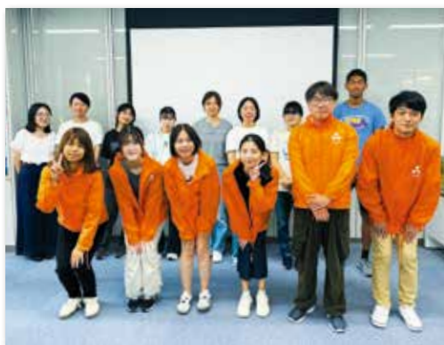
SIED Kyotanabe Campus / 京田辺キャンパス