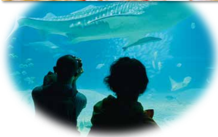
Osaka Aquarium Kaiyukan 海遊館