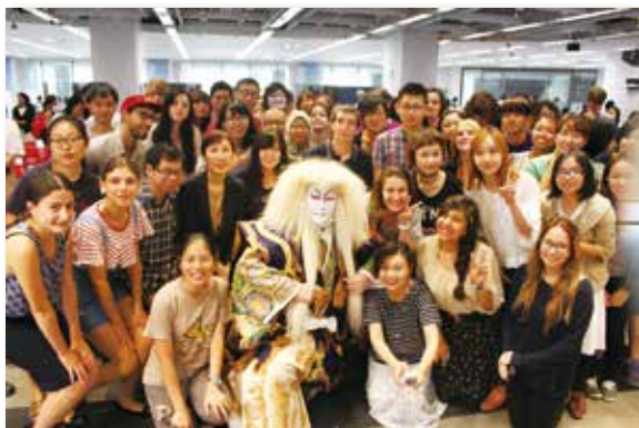
Kabuki Workshop 歌舞伎ワークショップ