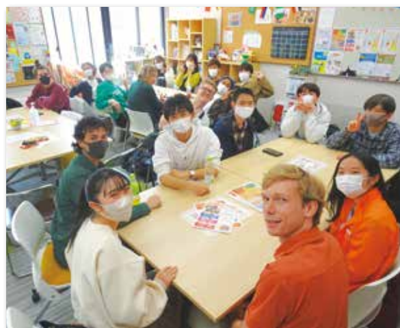
Lunch Talk ランチトーク