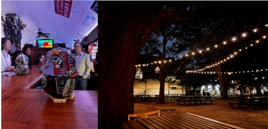
School's bar Valhalla

Valhalla, the on-campus volunteer-run bar, perfectly encapsulates this culture. Attending a post-seminar Happy Hour allowed me to engage in casual yet insightful scientific discussions with my lab members and connect with Taiwanese alumni. This experience reinforced the idea that "science stems from casual talks," a stark contrast to the more formal academic structures I was accustomed to in Taiwan.