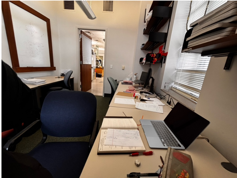
My place in the lab's office