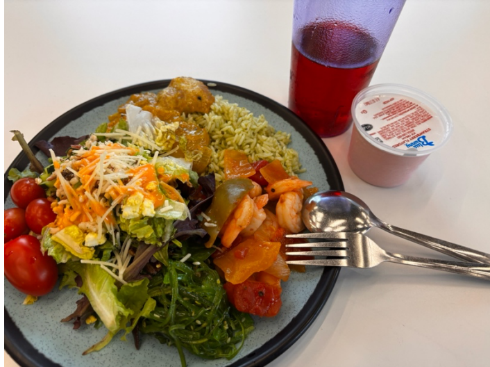
Meal at student's servery