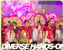
DIVERSE HANDS-ON CLASSES