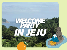
WELCOME PARTY IN JEJU